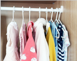
Community Cares dollars are at work helping the Fostering Hope Closet provide resources for foster families in Laclede County.

Lebanon is a friendly place where people really want to make a difference! By donating to Community Cares, YOU will help improve the quality of life for those most in need.