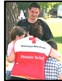
American Red Cross provides local disaster relief.