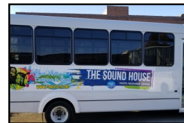
Project 360 Youth Services provides resources for at-risk and homeless youth.