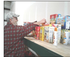
L-LIFE Food Bank provides food for local families in need.